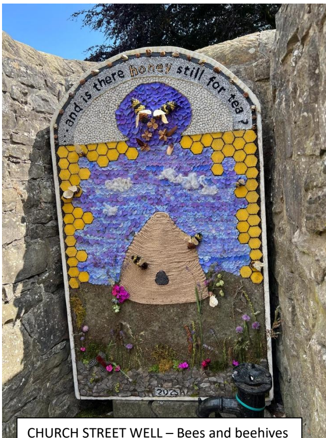
CHURCH STREET WELL – Bees and beehives