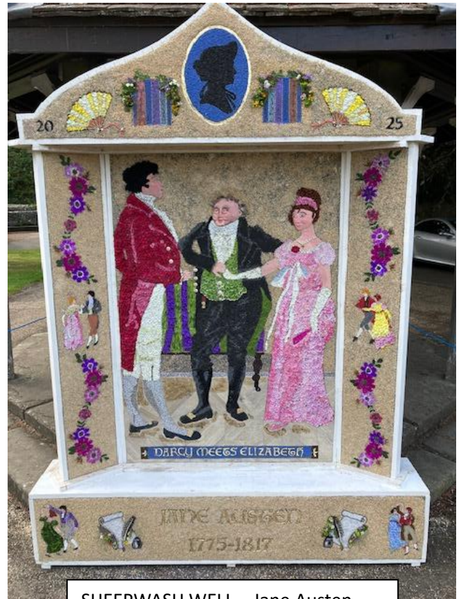
SHEEPWASH WELL – Jane Austen