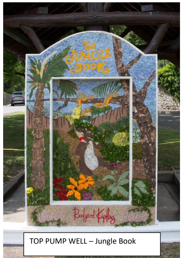
TOP PUMP WELL – Jungle Book