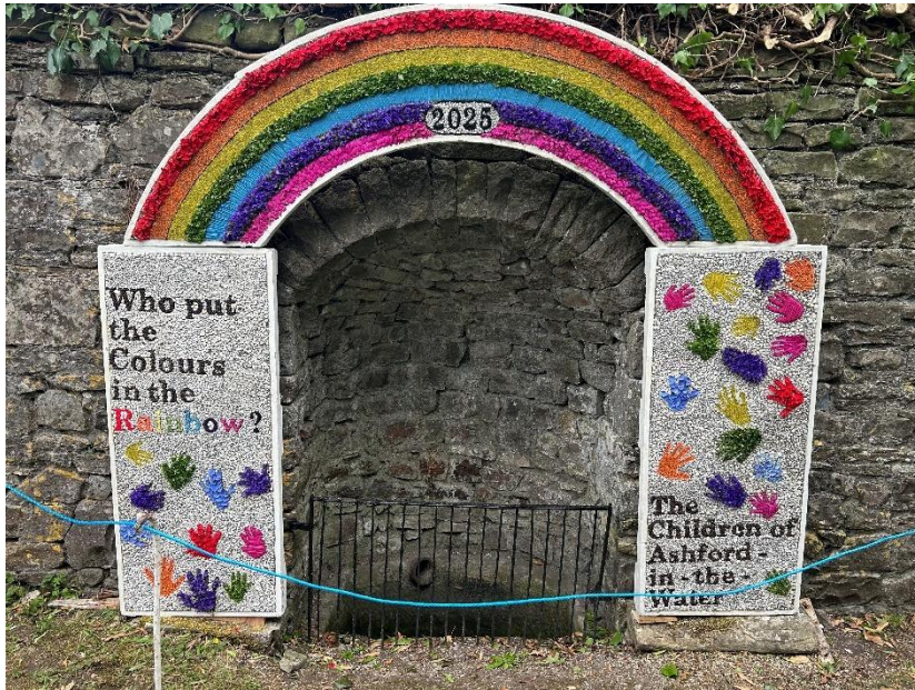
CHILDREN'S WELL – Rainbows and handprints