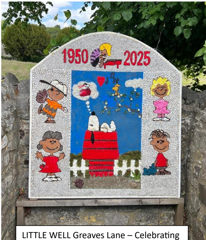
LITTLE WELL Greaves Lane – Celebrating 'Snoopy, Peanuts and the gang.'