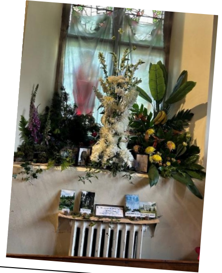
Sir Joseph & Sarah Paxton, horticulturalists and landscape designers