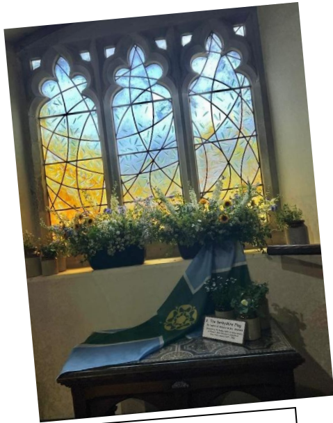
The Derbyshire Flag