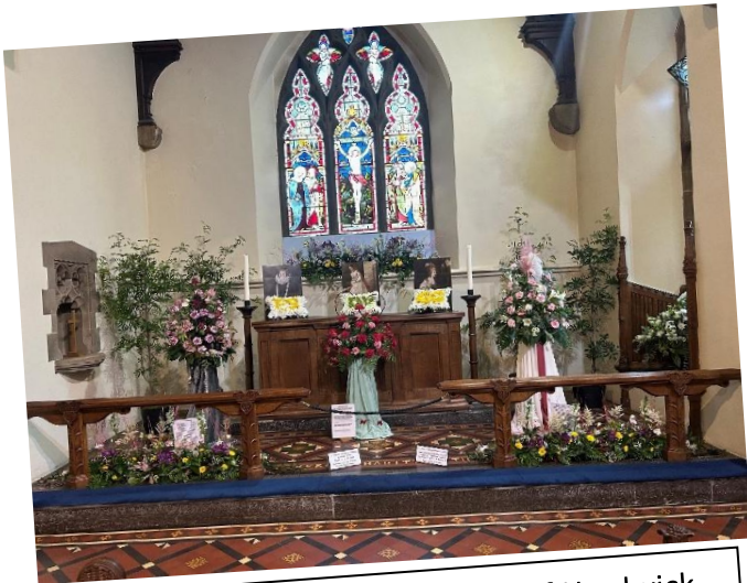
Three Famous Historical Ladies of Hardwick, Haddon and Chatsworth