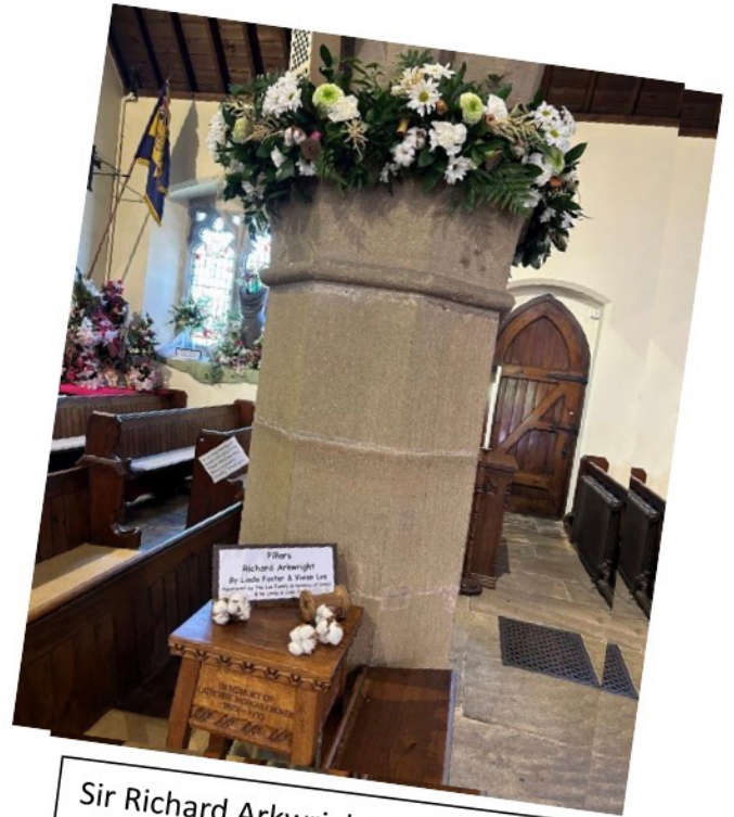
Sir Richard Arkwright, father of the modern industrial factory system

THANK YOU to all who made this year's festival such a great success! The displays were wonderfully creative and greatly admired. Once again you have surpassed yourselves and given great pleasure to all our visitors.