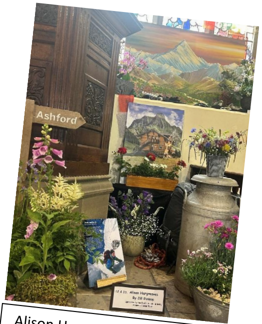
Alison Hargreaves, mountaineer