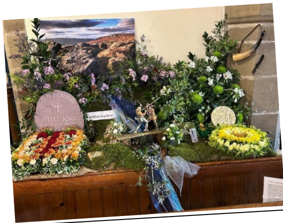
Little John, Hathersage's famous son