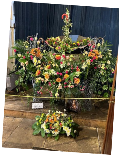
Samuel Fox, inventor of the modern umbrella