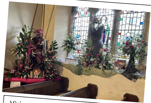
Vivienne Westwood, fashion designer