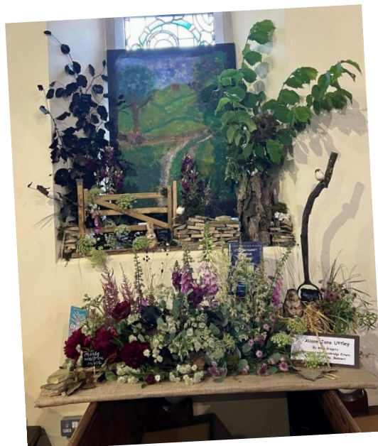
Alison Jane Uttley, writer