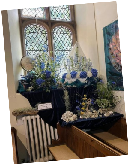
Dame Ellen MacArthur, sailor